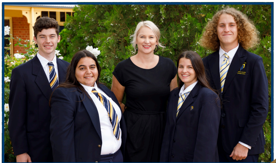
Above: 2020 School Captains.

We respect diversity in our student co-hort, in our staff and in our community. The College is a discrimination free zone and ask all of our families to help us to support this approach. More information on respectful relationship and family violence can be found at: https://www.1800respect.org.au/healthy-relationships/