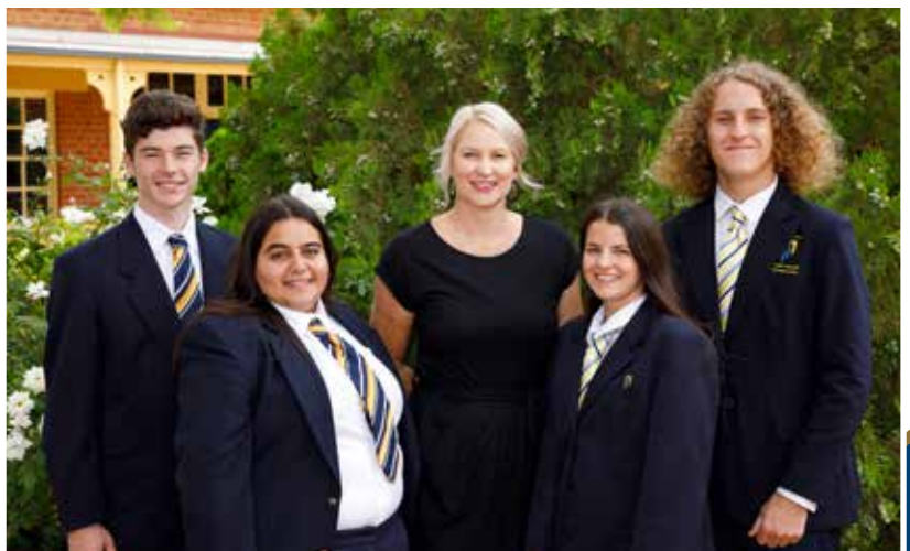
Above: 2020 Mildura Senior College School Captains.

We would like to respectfully acknowledge the Wemba Wemba People and the Millewa-Mallee People and their Clans; Latje Latje, the Nyeri Nyeri and Ngintait, the Traditional Custodians of the Lands on which we meet today and pay our respects to the Elders past present and emerging.